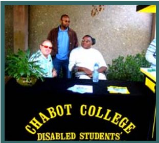
A scene from last year's Gladiator Welcome Day

CHABOT TRIVIA- Did you know Chabot College opened its doors for registration on September 11th, 1961?