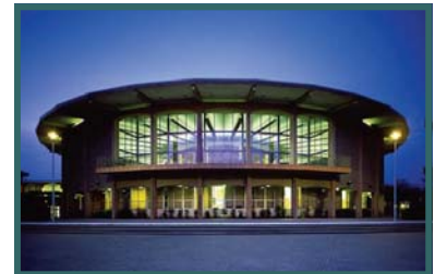
Chabot's Library & Building 100

recognized its 40th birthday with a community celebration following Commencement. Read future HOTSHEET issues for possible plans for a 2011 celebratory event.