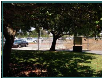
Construction photos of the new campus drive through

crews continue to work on connecting our two largest parking lots with an interior road. This will allow students to drive from one lot to the other without using Hesperian Boulevard. The new Campus Drive will also provide a new bus stop for the drop off and pick up of students and staff.