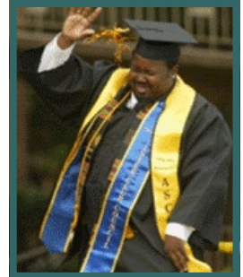
A happy Chabot graduate

PAC — Performing Arts Center; LT —Little Theater; CC —Chabot College; LPC —Las Positas College; DO —District Office.