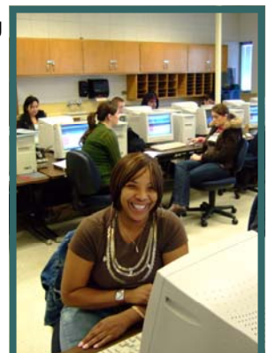
Chabot College business student

jnovak@chabotcollege.edu , or at (510) 723-6690.