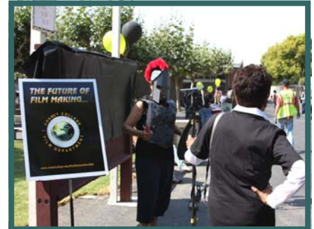
A Spartan appears at the recent Gladiator Welcome Day

It was all part of Rhodes' Film 50 class demonstration of movie production