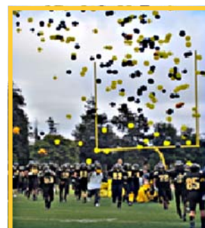
Homecoming 2009 will take place October 10th.

Meeting , Tuesday, November 17th, 6:30 p.m., LPC.