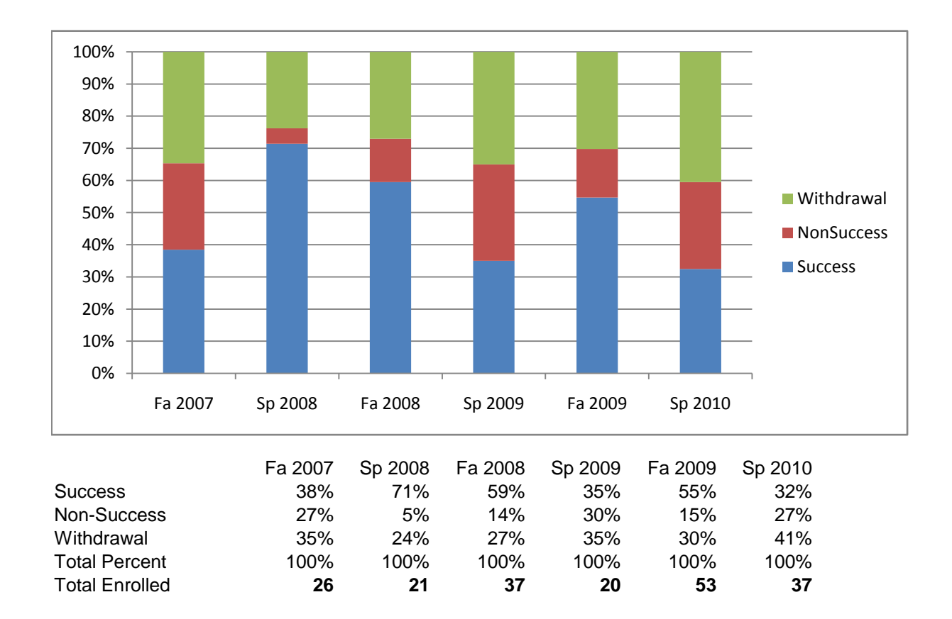
Chabot Success, Non-Success, and Withdrawal Rates By Semester Course: BUS 34