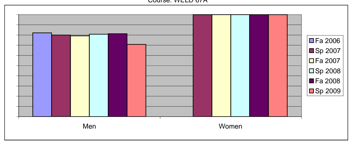
Chabot Success Rates By Gender and Semester Course: WELD 67A