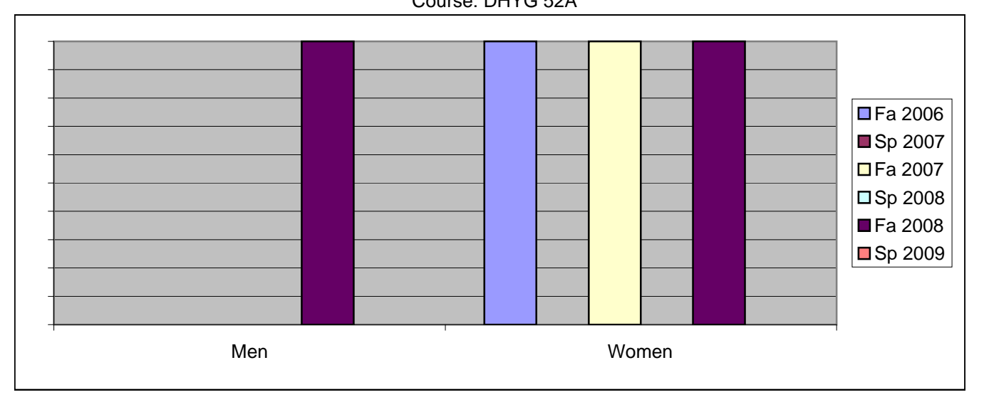
Chabot Success Rates By Gender and Semester Course: DHYG 52A