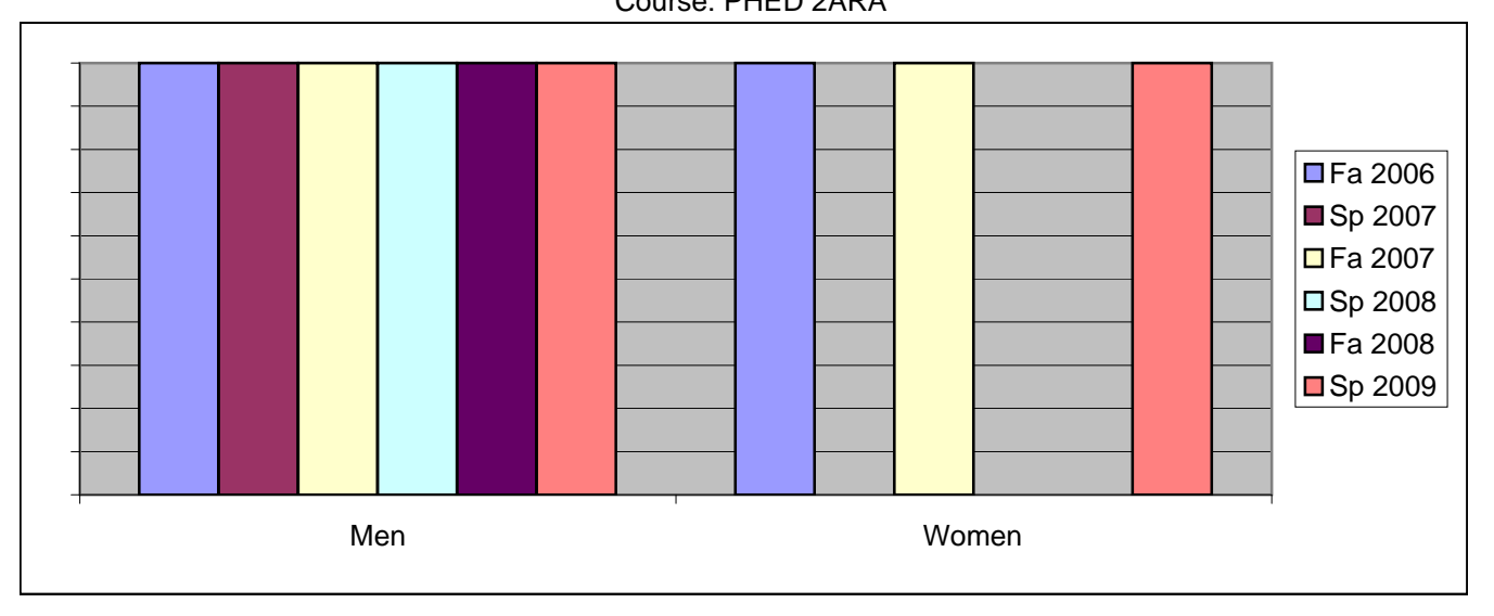
Chabot Success Rates By Gender and Semester Course: PHED 2ARA