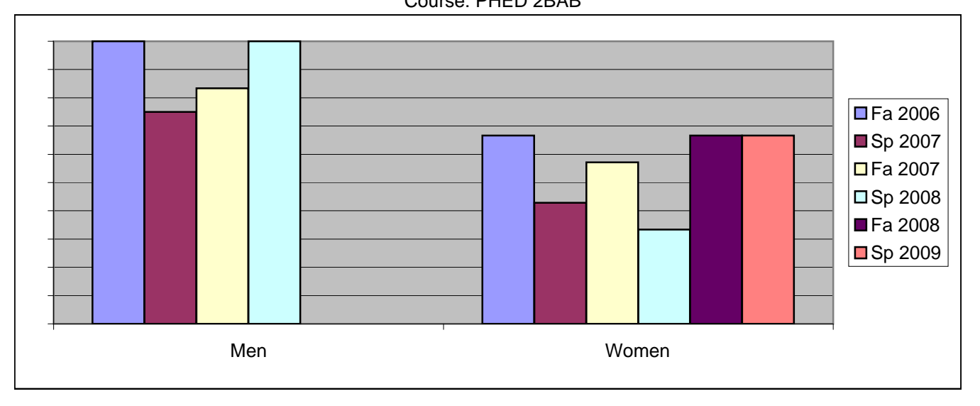
Chabot Success Rates By Gender and Semester Course: PHED 2BAB