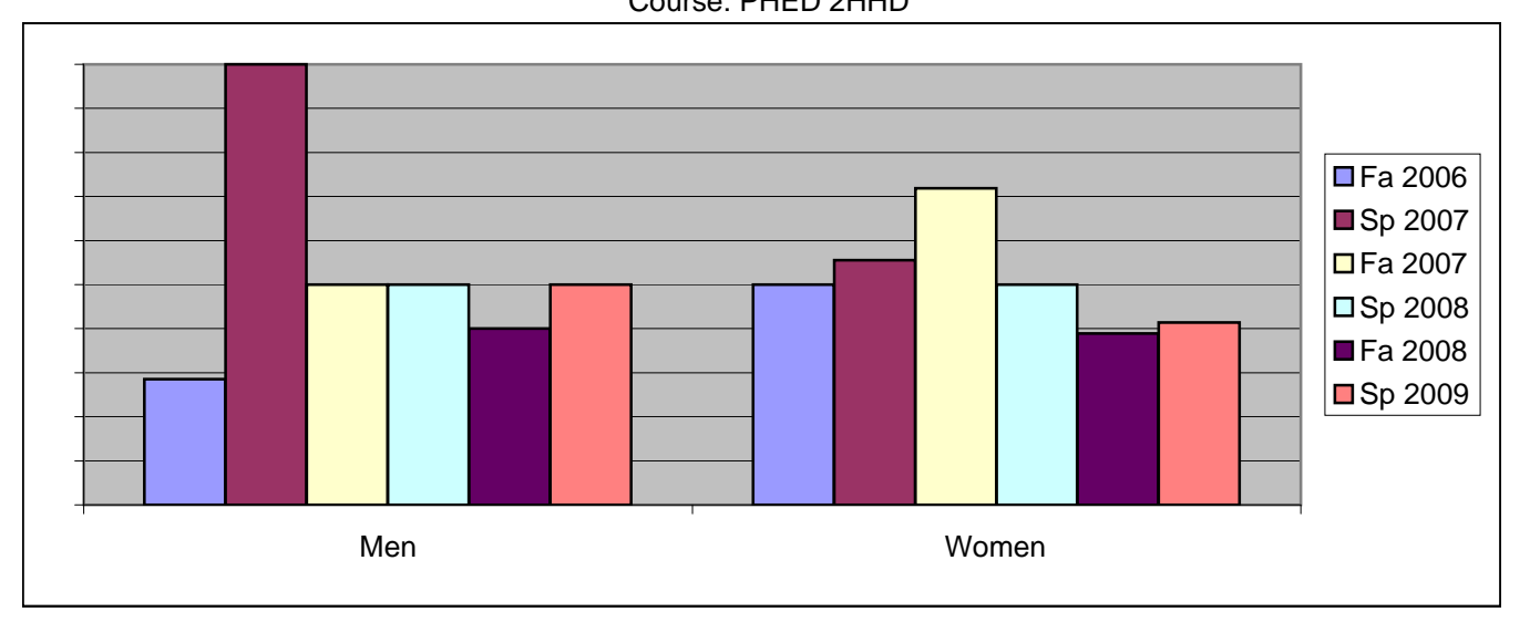
Chabot Success Rates By Gender and Semester Course: PHED 2HHD