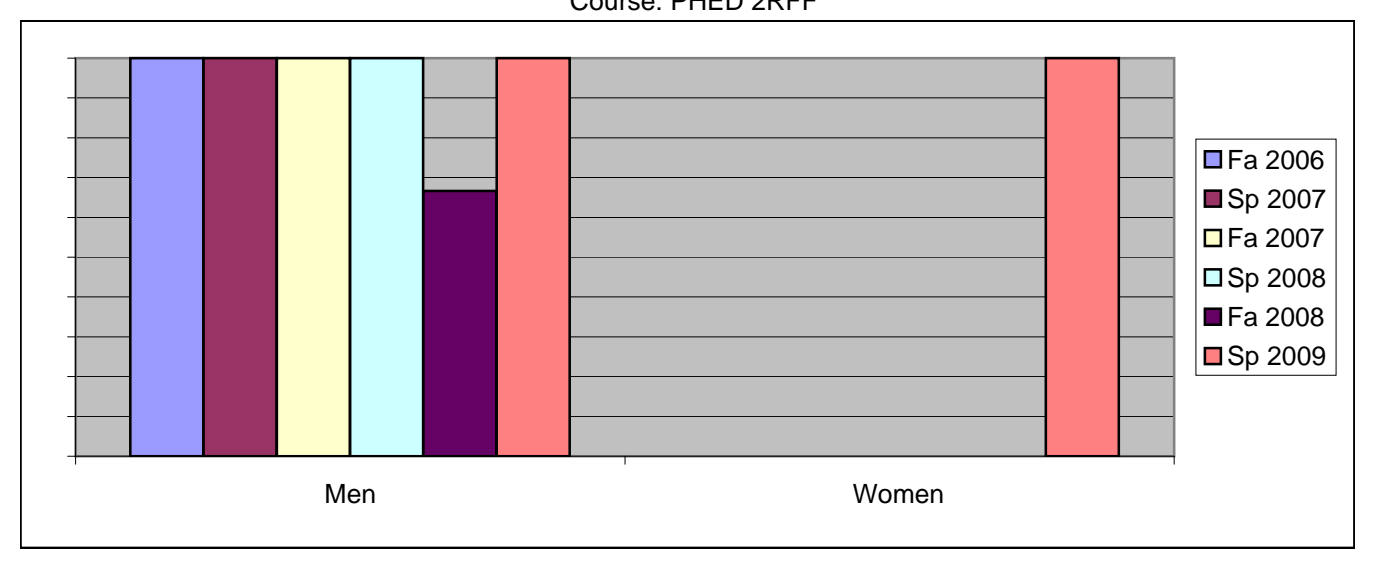
Chabot Success Rates By Gender and Semester Course: PHED 2RFF