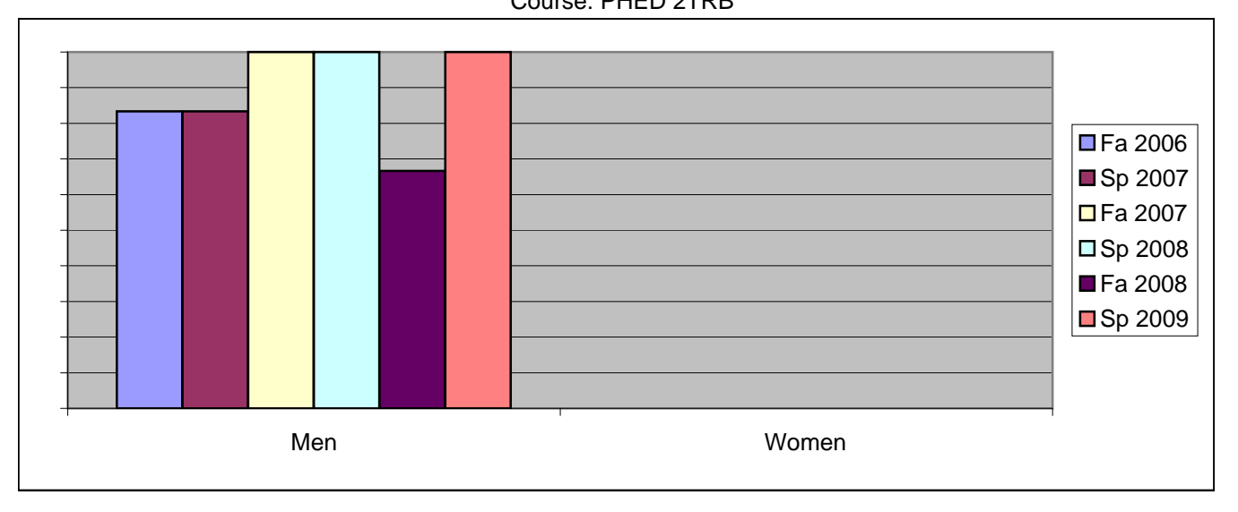
Chabot Success Rates By Gender and Semester Course: PHED 2TRB