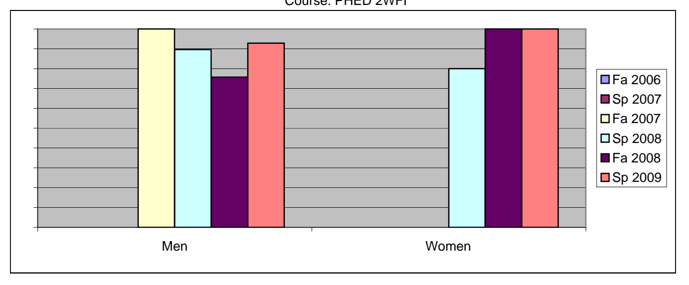
Chabot Success Rates By Gender and Semester Course: PHED 2WFI