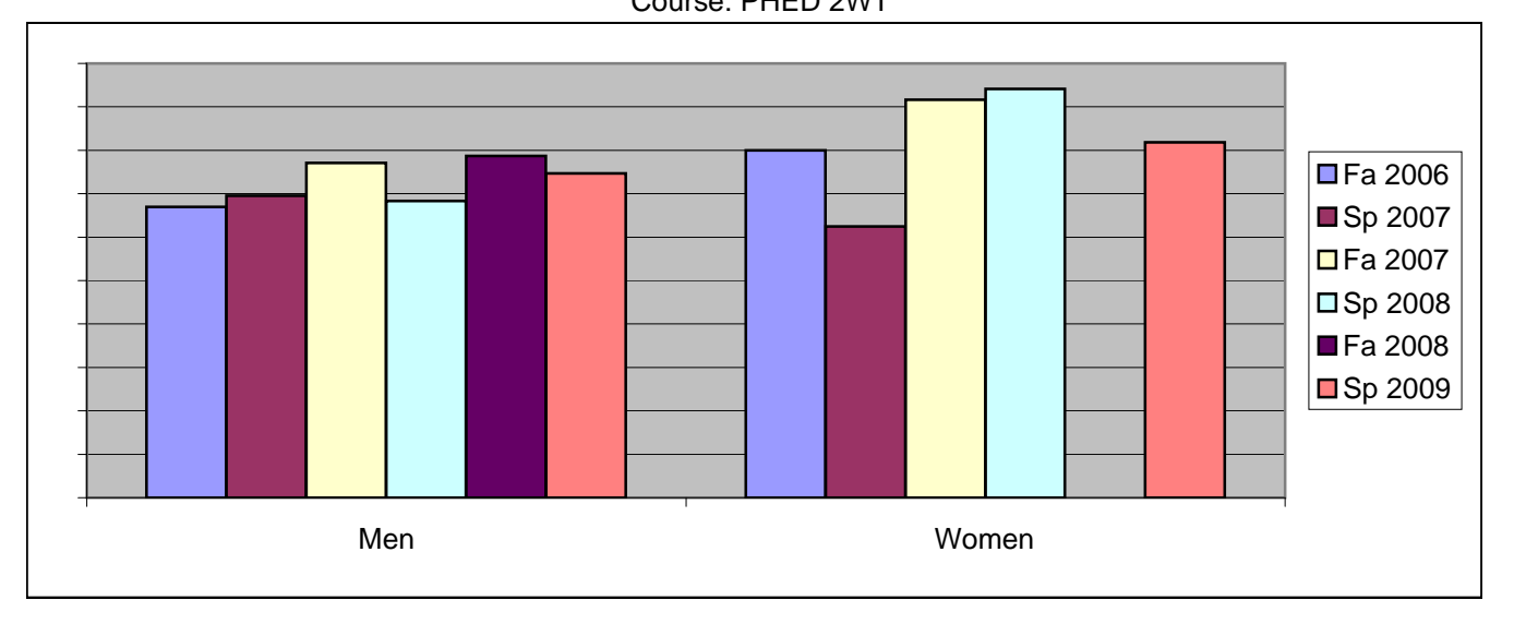
Chabot Success Rates By Gender and Semester Course: PHED 2WT