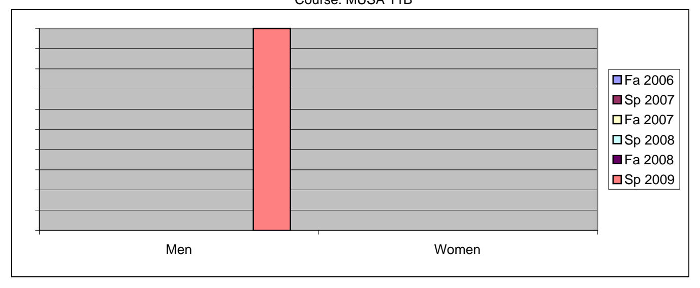
Chabot Success Rates By Gender and Semester Course: MUSA 11B