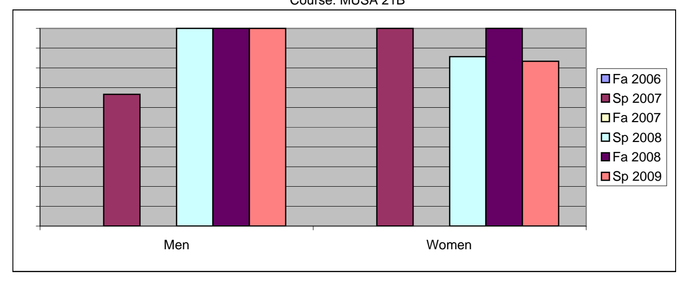
Chabot Success Rates By Gender and Semester Course: MUSA 21B