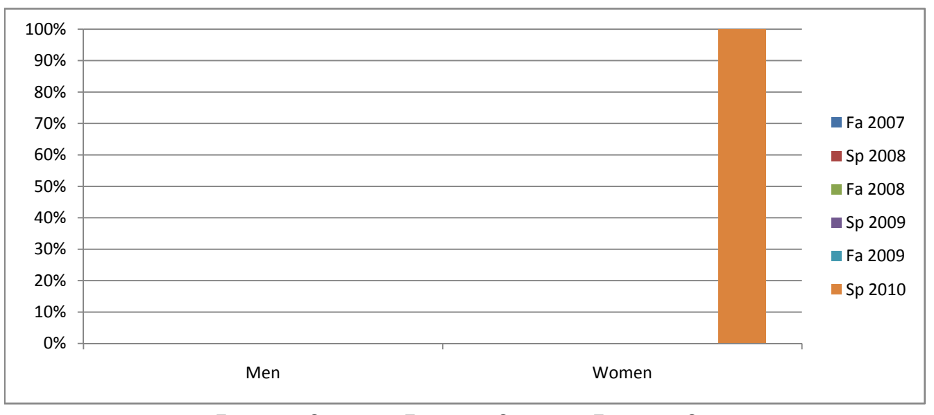
Chabot Success Rates By Gender and Semester Course: MUSL 29