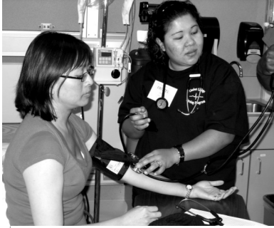
Skills Lab available daily for students