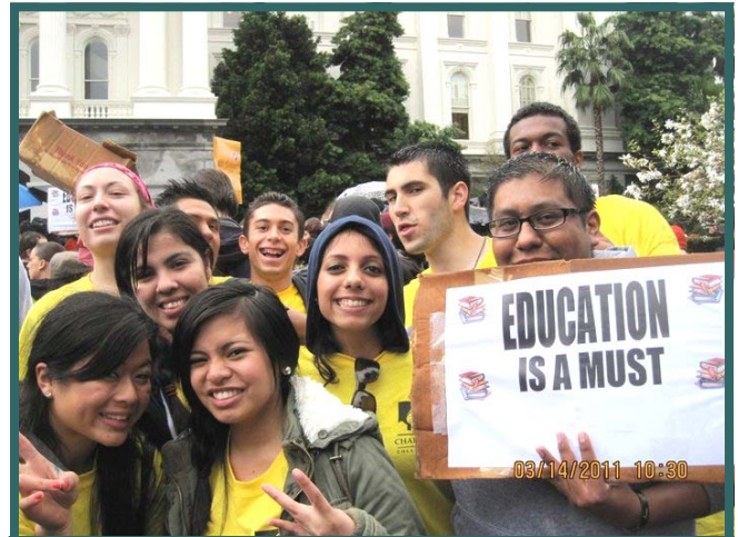
ASCC Senate members participate in a wet and windy March in March budget protest with other California Community College students

ASCC This year's ASCC Board have been active and have coordinated a variety of on campus and off-campus activities going from participating in a Harvest Festival at AAA, Chabot's neighbor, to coordinating the bus trips to Sacramento to protest budget cuts. Here are photos of a few events.